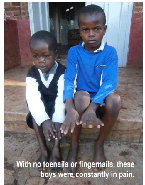
With no toenails or fingernails, these boys were constantly in pain.